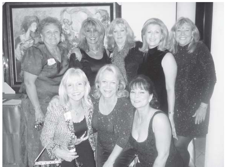
Pinion Gals still having fun!!