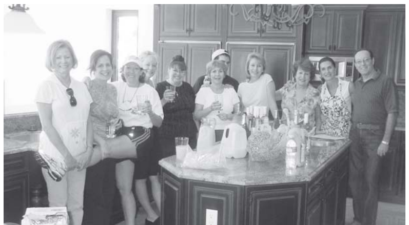
The Clean Up Crew celebrating another successful event